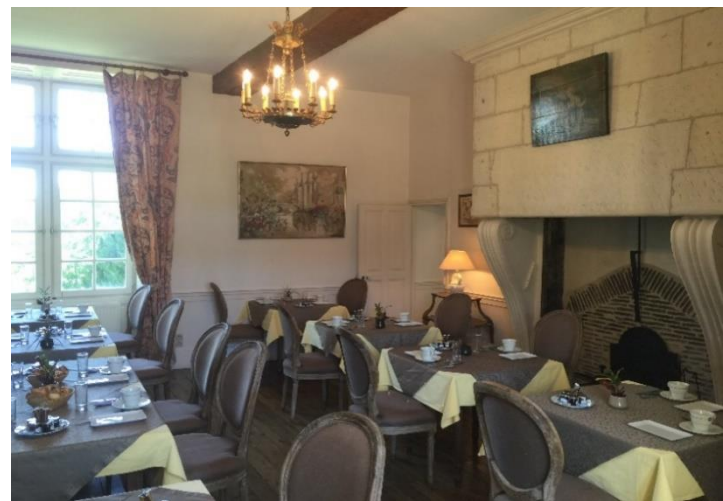
The Evêque room 45m 2 / 30 people seated