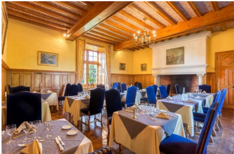
The wooded room 50m 2 / 35 people seated