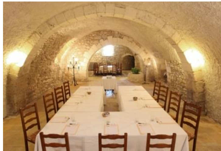
The Voûtée room 100m 2 / 30 to 80 people seated