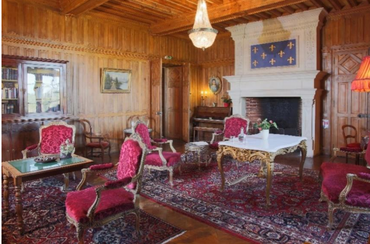
The royal Duke lounge