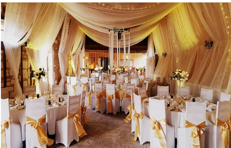
The Ecuries 195m 2 / 60 à 216 people seated